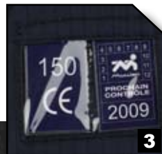
SERVICE DATE / NORM INFORMATION WINDOWS