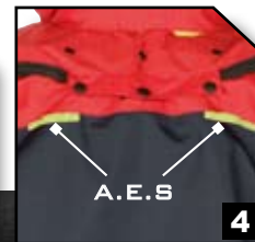
AIR ESCAPE SYSTEM