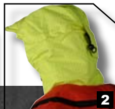
HIGH-VIS HOOD STORED INTO COLLAR